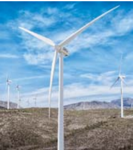
Throughout Central Queensland, there are several wind farms at different levels of progress.

series of workshops held has been the realisation of the nomenclature "Collaborative" in the organisation's name. It was always intended that, by working more closely together towards shared objectives, new and better linkages would be made between economic and business organisations and key local medium sized businesses.