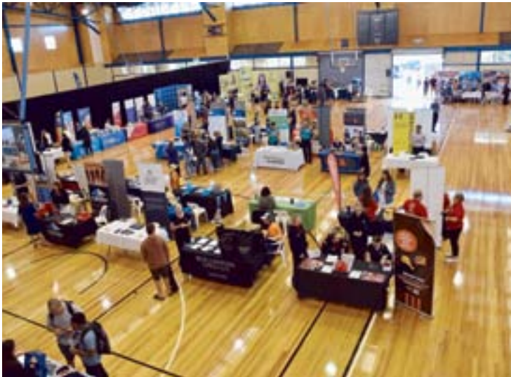
Hundreds of students from Central Queensland schools attended the Expo.