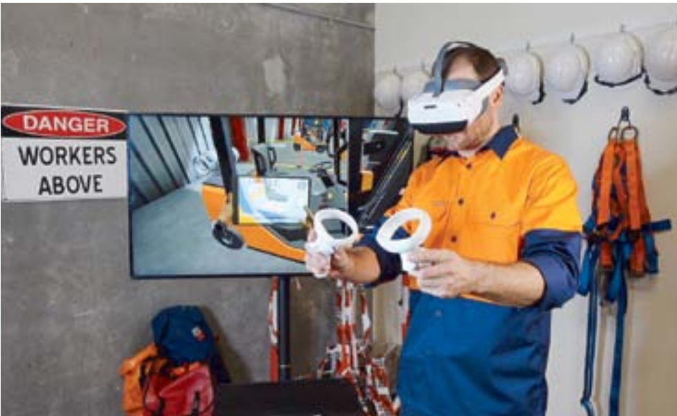
Worker tests out a 'working safely at height's courses via a virtual simulation.

"The outcomes of the study provide an interesting case for training providers to further investigate emerging training technologies - CSQ will be keenly watching the commercial response to the research from here.