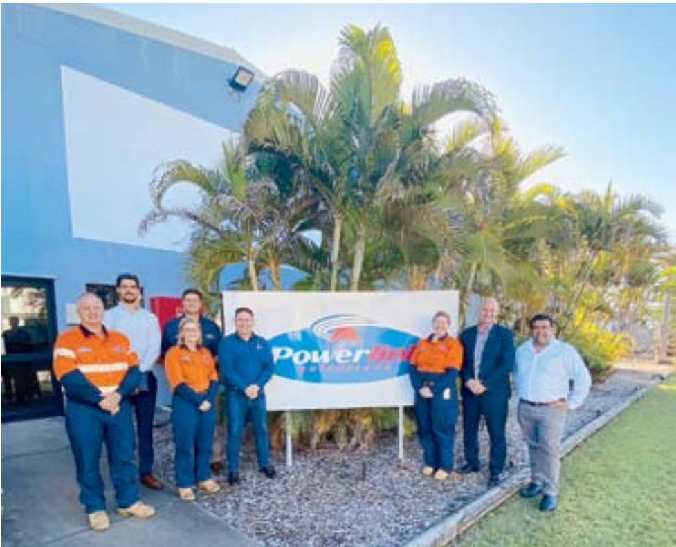
Queensland's SuperGrid Training Centre and Transmission Hub has officially opened in Gladstone.