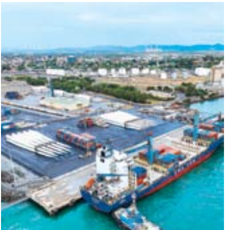
ANL's Kokoda berthed at Gladstone Ports Corporations Auckland Point Terminal for the first time.

into new and emerging commodities. "We are launching a highly efficient operation right here in CQ, with all the associated advantages for the region," he added. "We have an abundance of land and are currently talking to a number of proponents about developing a warehousing precinct, known as DistriPark, which would cater to cold storage and warehousing facilities. "The land we have is both on dock, or near dock, which is ideal for an efficient container terminal," he said. "Customers who are seeking to grow their already significant container freight task will provide the building blocks for operations in the future and we look forward to working with all of them." GPC looked forward to working with ANL going forward to further develop this service into the future.