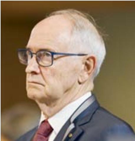
Our progress will stop if we don’t acknowledge the scale of change necessary, says Ross Garnaut.

He noted the prime minister mentioned it during his election night speech. And the treasurer twice referenced Australia’s future