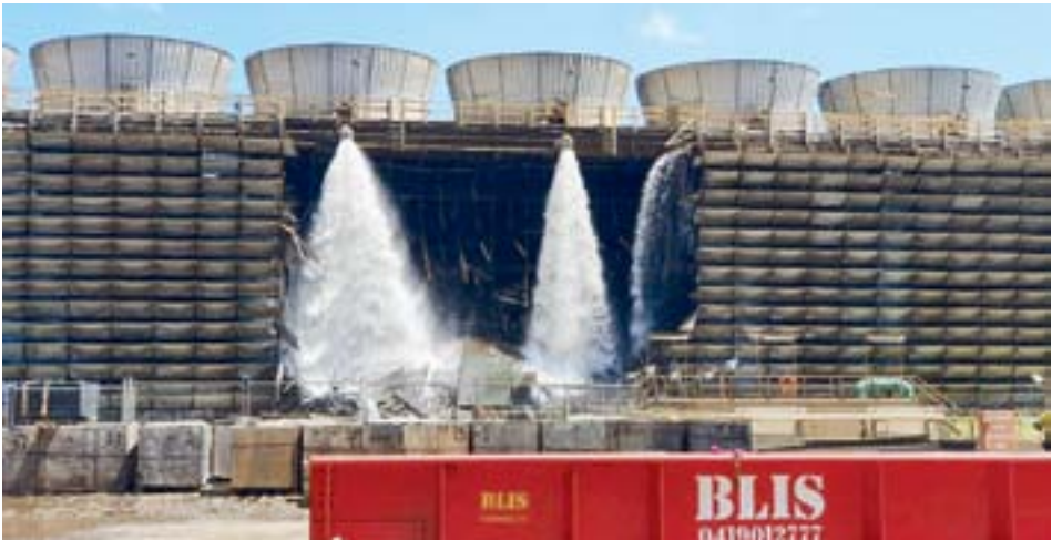
Return to service dates for Callide C Power Station units C3 and C4 have been delayed until 2024.

“CS Energy is acutely aware of the importance of reliable generation from coal-fired generators such as the Callide C Power Station, particularly at a time of high gas and coal prices and with reducing coal generation across the energy sector,” Mr Varvari said.