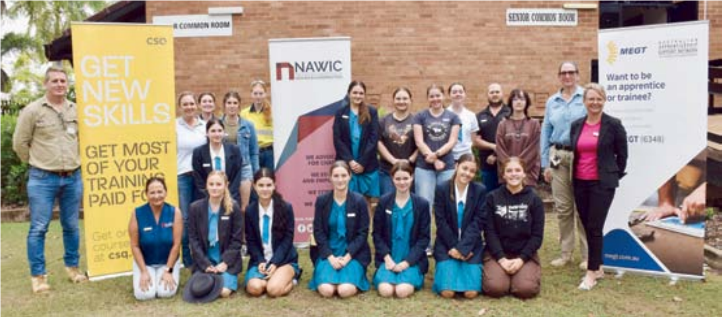
Students had the opportunity to explore trades at National Association of Women in Construction’s ‘speed career’ event.

“We emphasise the importance of absorbing everything they learn, asking questions and taking the handout pamphlets home.