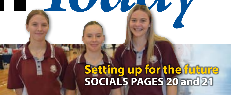
Setting up for the future SOCIALS PAGES 20 and 21