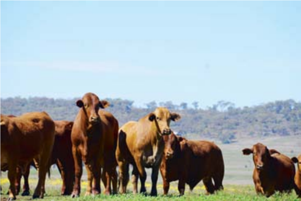
How big and vital is the cattle industry?