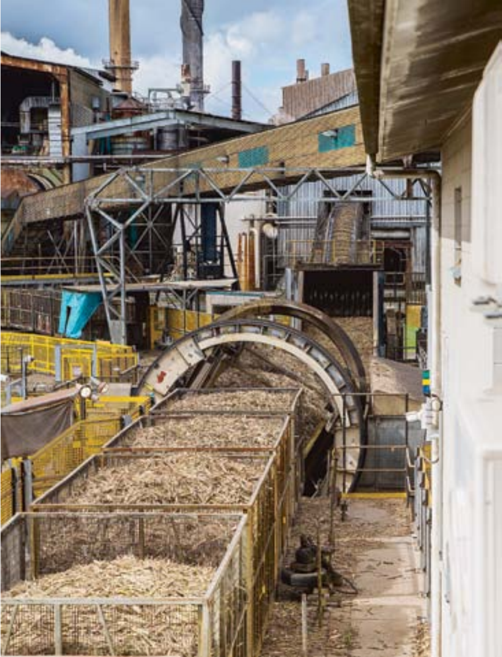
Cane received at Mackay Sugar.

Another positive for the industry is that the very profitable price outlook that prevails for the Australian industry is expected to bring a halt to the steady decline in area planted to sugarcane experienced in the past five seasons. This is important for all the industry but particularly so for sugar factories enabling them to maximise throughput, sugar production, and returns.