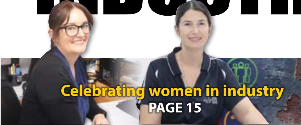
Celebrating women in industry PAGE 15