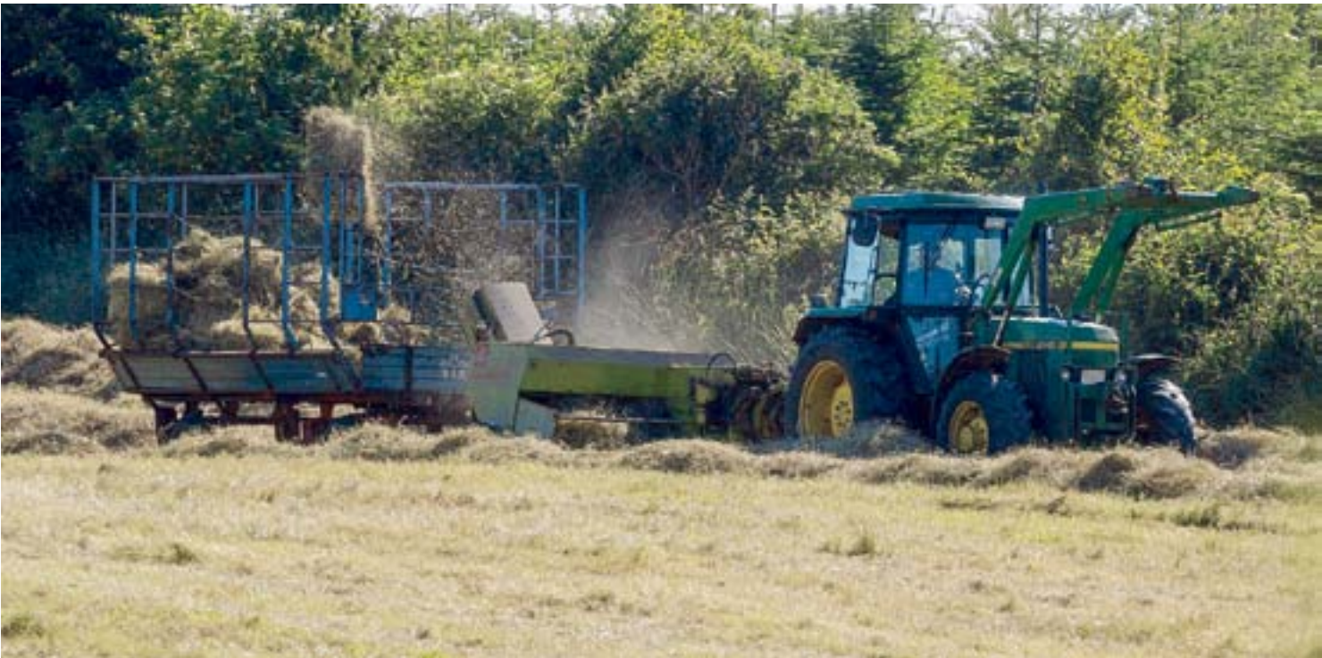
QAWN officers across the state are available to help connect employers and workers.

The RJSA is coordinated by the Queensland