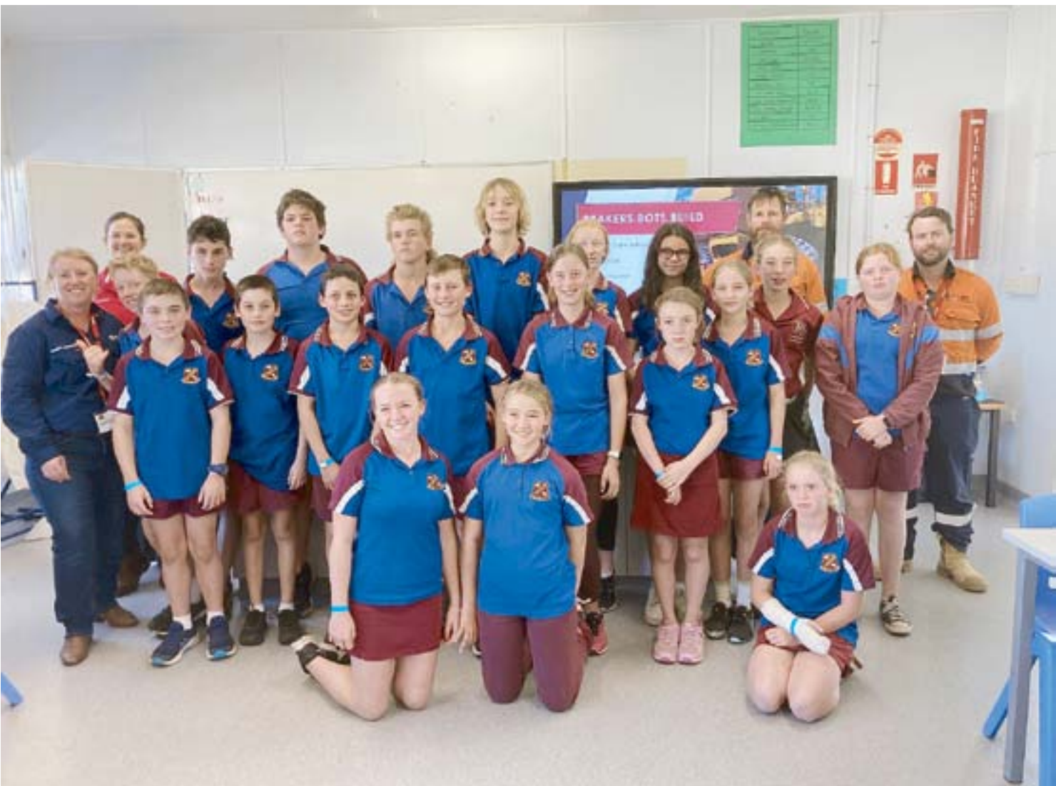
Theodore State School students participated in a resources workshop and explored their problem-solving abilities.

"The students also discovered how remote site sampling can be achieved by building their