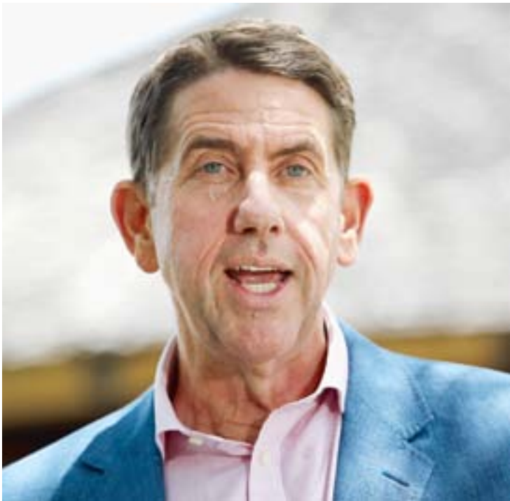
Queensland Treasurer and Minister for Trade and Investment Cameron Dick.