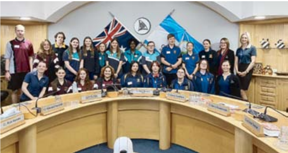
Students enjoyed a visit to Gladstone Regional Council's chambers earlier this month.