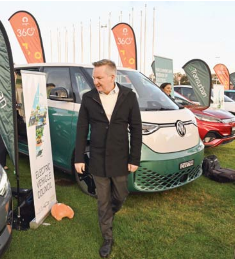
Energy Minister Chris Bowen says encouraging more EVs in rideshare fleets will reduce emissions.