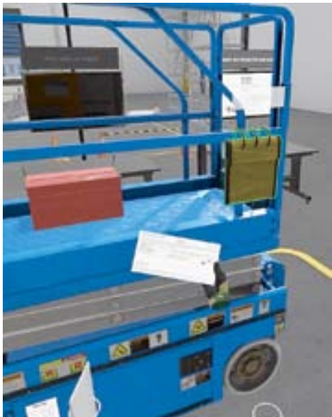
VR has been proven as a successful engagement tool.

"Safety will remain paramount in all construction training conversations, including considering the introduction of VR into the current training industry/"