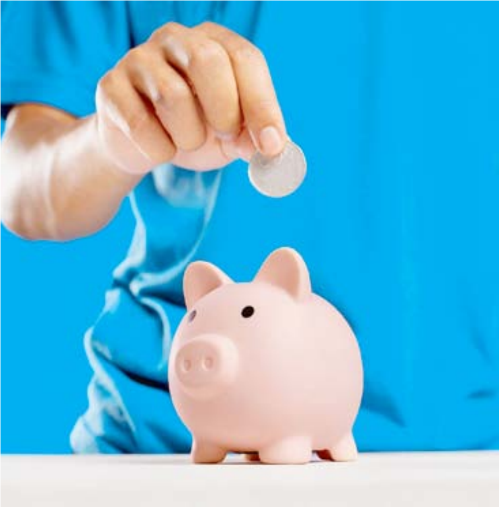
Australia's minimum wage increase will have significant effects for millions of workers and businesses in the country.

Bjorn Jarvis, ABS head of labour statistics said, "In trend terms, the strong growth in hours worked, the high employment-to-population ratio and participation rate, along with the low unemployment and underemployment rates, all still point to a tight labour market."