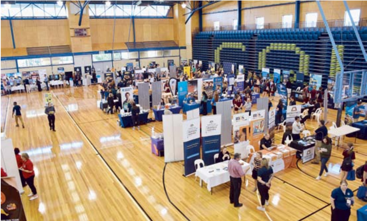
CQUniversity hosted the Capricorn Mega Careers Expo in partnership with Advance Rockhampton and the Rockhampton Manufacturing Hub.