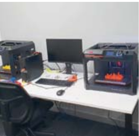
The Centre also provides access to a range of interactive hi-tech educational resources.