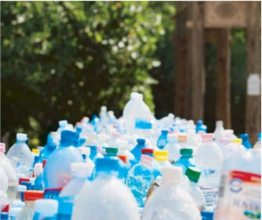
The government will force standards on the packaging industry, after self-regulation failed.