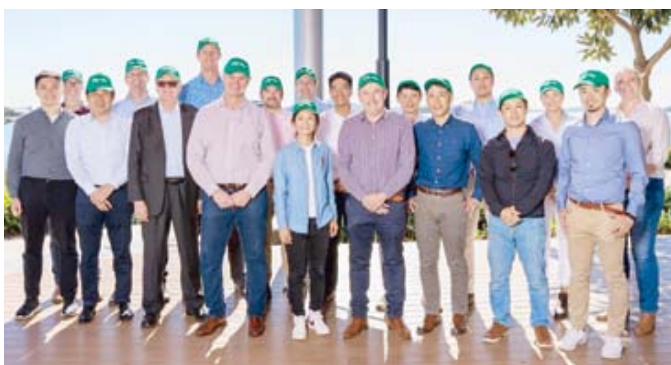
Major players involved in the Central Queensland Hydrogen project visited Gladstone to look at proposed renewable hydrogen project sites.